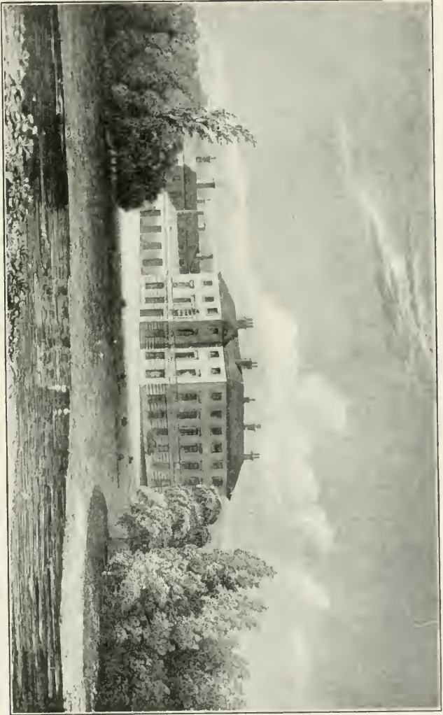
THORESBY HALL IN 1833. NOTTINGHAMSHIRE, ENGLAND.